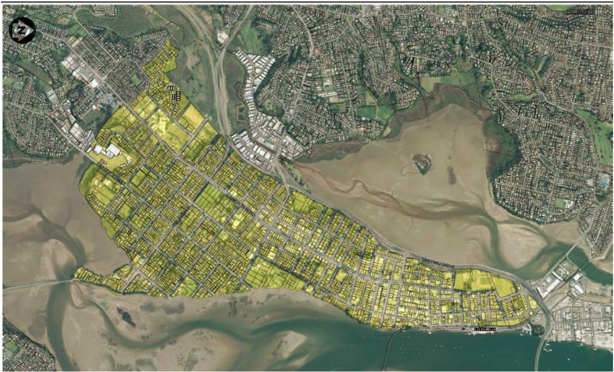
Image : Te Papa Peninsula